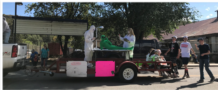
First Place Float - Junior Class! Theme: Spacecraft