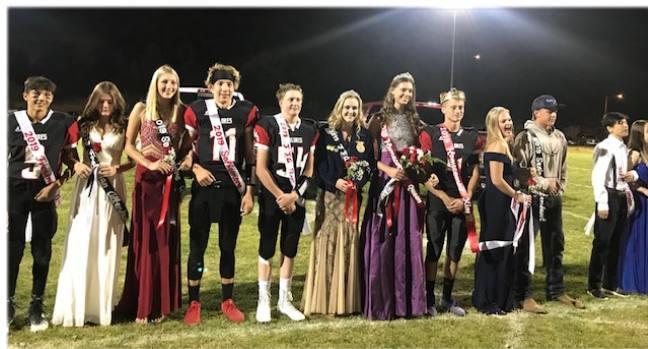
Homecoming Court 2019