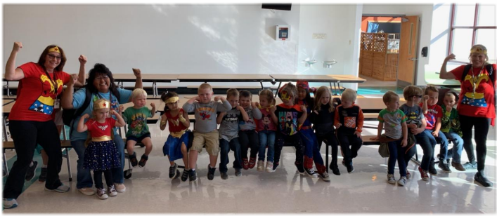
Our preschoolers getting into the spirit of Super Heroes!