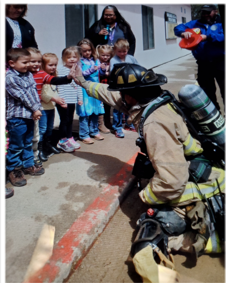
Firefighters sharing with our preschoolers