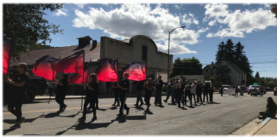
Flag Team and Marching Band in Parade