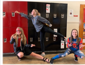
Watch out Spider Man!