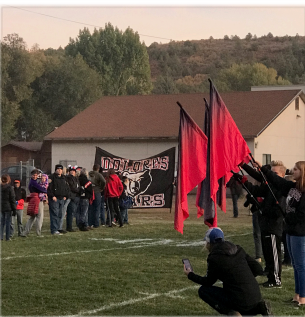
Flag Team and fans waiting for their Bears!

The football players served the first responders dinner and then joined in to eat before their game. They barbecued hot dogs and burgers with all of the side dishes.