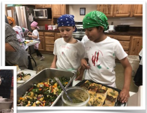
Our student chefs hard at work!

The Middle School Girls Cross Country Team finished 5th in the Colorado Middle School State Championship in Denver on October 19th. The Dolores Cross Country team improved from 18th in 2018. The Bears were also the best 2A school in the State! The girls were led by 7th graders and 6th graders and return all top runners for next year.