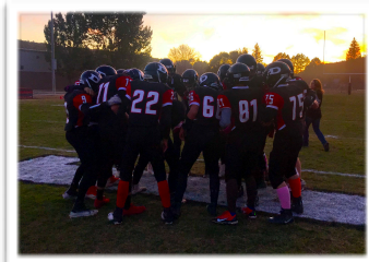
Psyching up before the game!

The activities before the game brought many to tears. The fire trucks and police vehicles were lit up and flashing while the huge American flag was displayed. Both football teams circled the infield while our bears held flags. The music played was well chosen and the reading at the start of the game inspired everyone.