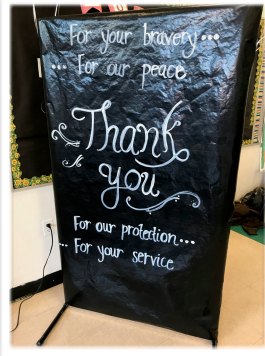
Decor was amazing!