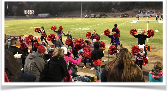
Little Bear cheerleaders at their best!

The activities before the game brought many to tears. The fire trucks and police vehicles were lit up and flashing while the huge American flag was displayed. Both football teams circled the infield while our bears held flags. The music played was well chosen and the reading at the start of the game inspired everyone.