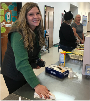
Football moms helped the team serve honorees dinner.

This year our football moms really set the standard for years to come. It was their desire to see their sons recognize the effort of our local first responders. The moms met together and planned an amazing evening honoring these fine men and women. Those fire fighters, EMT's, and police in attendance truly were honored. This was a tangible example of how we should be thankful for the service of others to keep our community safe.