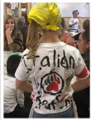
Very proud of their t-shirts!