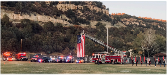
Unforgettable pre-game presentation

The Bears were not able to pull out a win but truly played from their hearts. A highlight of our hometown games is the Little Bear Cheerleaders. They were so great! The marching band and flag team added to the unforgettable evening.