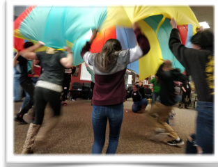
Students participating in team activity with Sources of Strength.