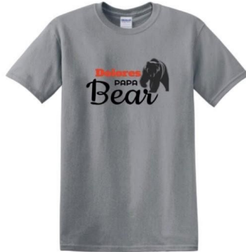
Gravel colored Cotton T-shirt with Dolores Papa Bear logo.