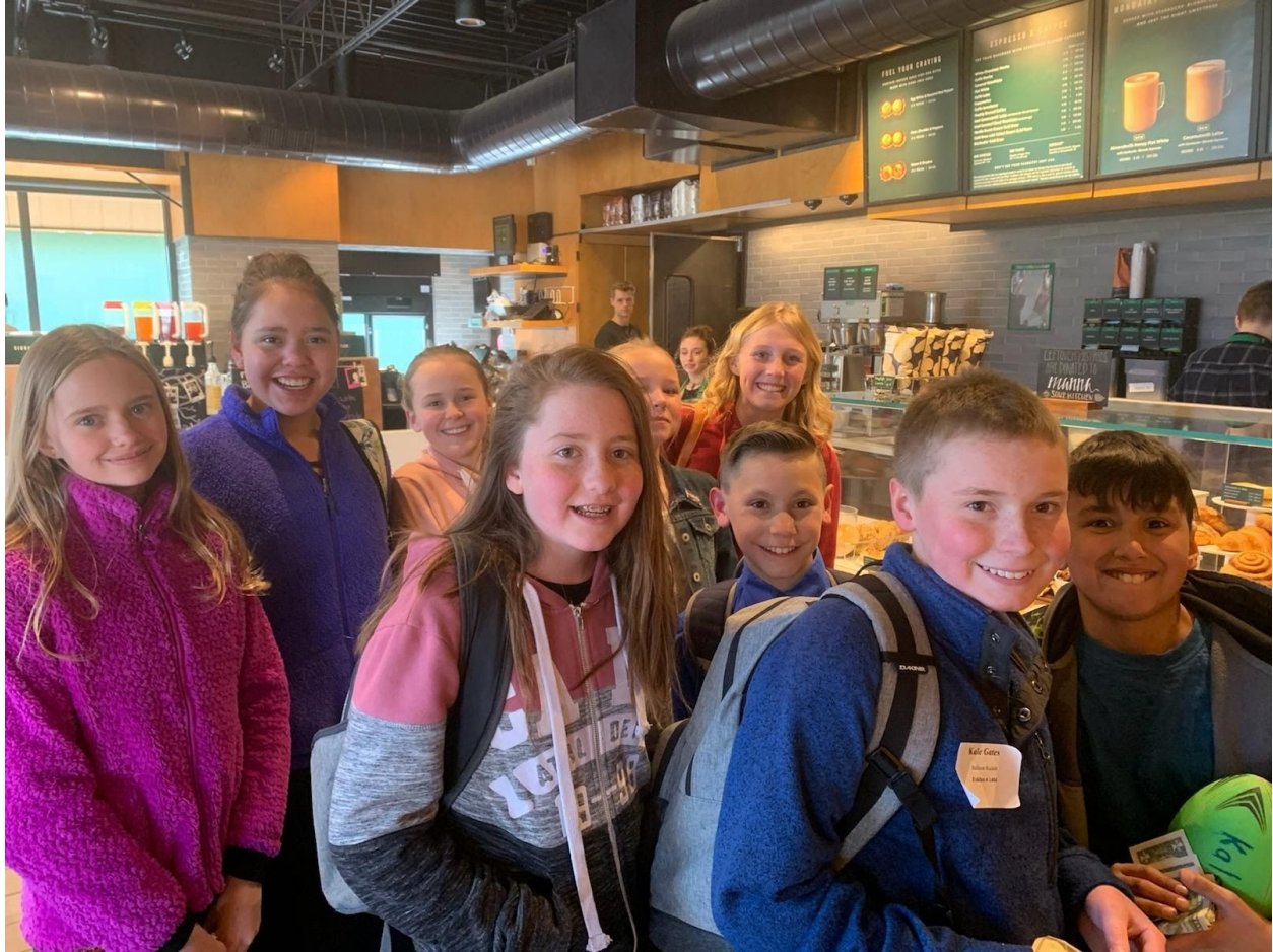
6th Grade Students enjoying a little down time between events at Starbucks.