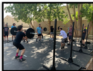
Outdoor CrossFit Class - High School Students