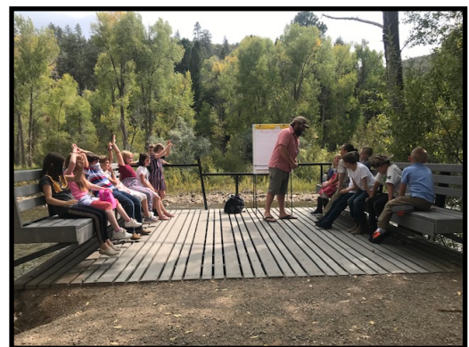
Third Grade Class Learning by the River

"Our teachers have had the opportunity to use the garden area behind the elementary school, a covered tent area, an area under a pavilion, a picnic table in front of the school, and some other areas that are local like the river park. Our teachers have enjoyed being able to get their classes outside