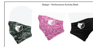
Badger - Performance Activity Mask