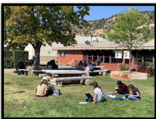
Students in the High School Working Outside

In September, the toddler room has been exploring the world of bugs. The children have really enjoyed the activities provided. They have freed the frozen bugs, went on a bug hunt, did bug stamping and more. They have learned that bugs have six legs and come in all shapes and sizes. Some have wings and some don't. It has been really fun watching them get to know bugs.