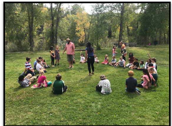
Outdoor Learning Fun