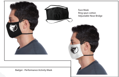
Face Mask Ring spun cotton Adjustable Nose Bridge