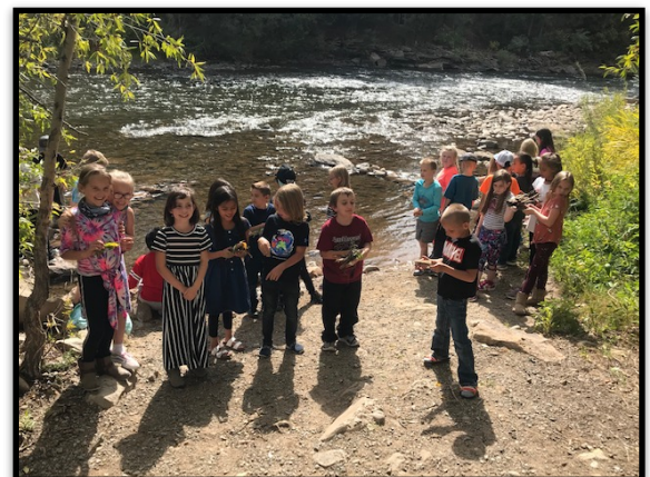
Elementary Students by the River