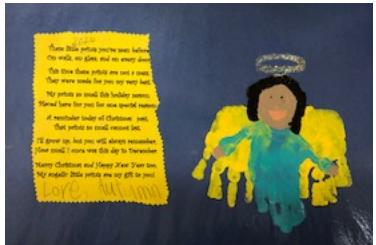
Handmade Angel Art by an Elementary Student