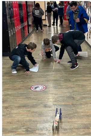
STEM students "racing" mousetrap cars