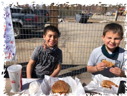
Home of the Bears