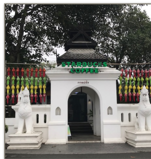
Photo taken from travels in Thailand.

Math, Science, and Arts are taught to develop the innovation and creativity desperately needed in our world. Students grounded in these areas are more apt to lead and create. Creativity is actually the highest level of education. It is one of the greatest “WHY’s” we have. The partner of creativity is innovation. Our students are not competitive in the areas of math and science because we have forgotten the WHY.