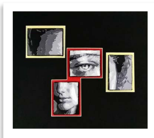
Award Winning Mixed Media: "7 Shades of Grey"

"I found I could say things in color and shapes that I couldn't say any other way-- things I had no words for." Georgia O'Keeffe