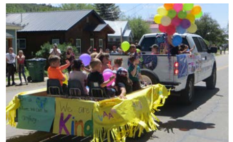
Preschool graduates in the parade