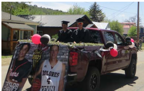
Seniors on the parade route

Last year due to the pandemic, the graduates and their sponsors got creative and decided on a socially distanced parade through our community. It was so well received, the leadership decided to