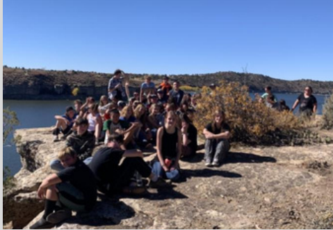
8th Grade takes a moment to enjoy the Overlook Trail