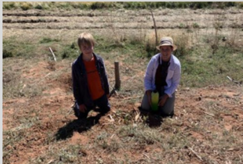
Down in the dirt