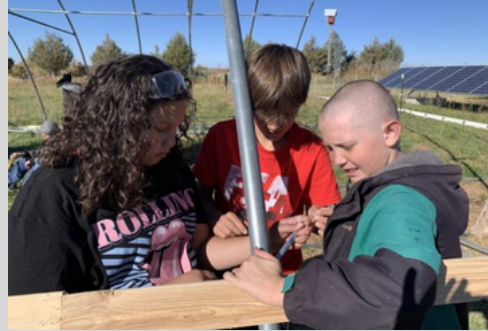
Students help put up a newly donated hoop house.